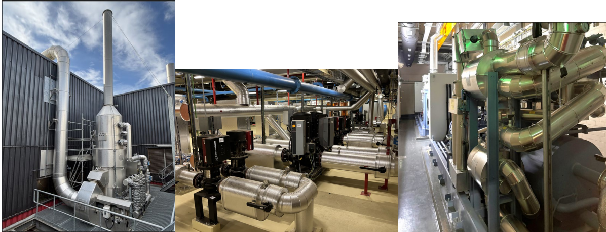
Figure 2: (From left to right) Venturi-scrubber, Water-pumps & Heat-exchangers, Heat-pumps