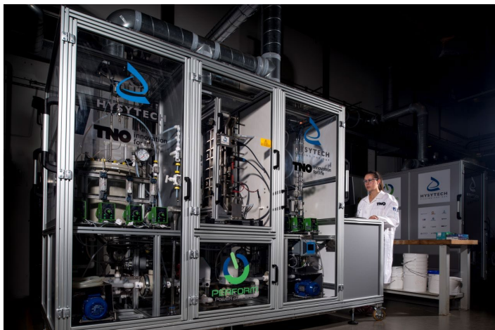
Scale up facility at TNO

Once the lab scale experiments were finished, obtaining satisfactory results, such as a high degree of oxidation, after optimization of the reaction conditions. The optimized reaction conditions were transferred to TNO for up-scaling the electrochemical conversion process. A picture of equipment used at TNO is given below.